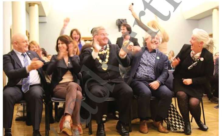
The Galway 2020 team celebrate being shortlisted late last year.

November, Last Galway, Limerick, and a joint bid from Wexford, Waterford and Kilkenny dubbed The Three Sisters - were shortlisted for the European Capital of Culture 2020 status. The following month, the ECOC selection panel produced a Selection of The European Capital of Culture in 2020 in Ireland-